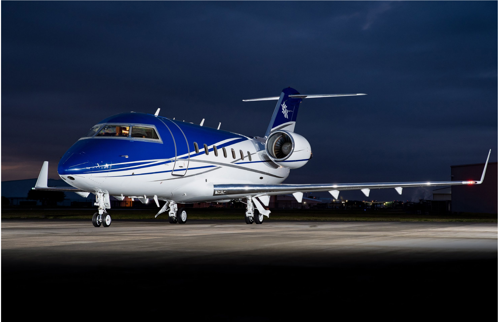
1992 Challenger 601-3A SN 5116 N436DM